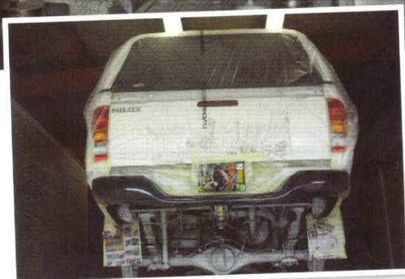
◀ A Toyota Hilux ute wrapped in protective plastic while the underside is being media-blasted.